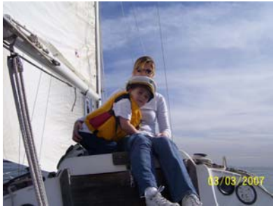
Checking out the view topsides in San Diego